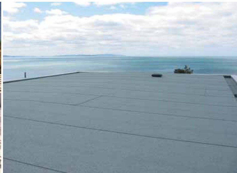
North Shore house