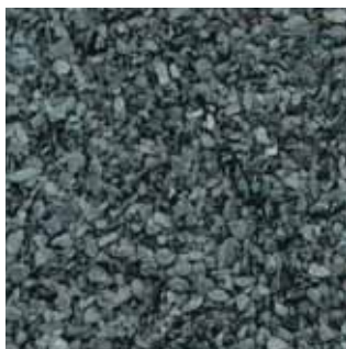
Nuraply 3PM - slate