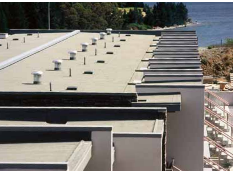
Pounamu Hotel, Queenstown