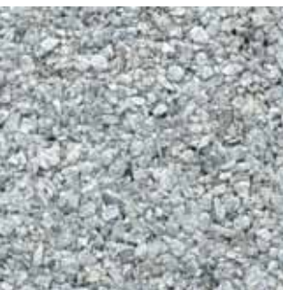
Nuraply 3PM - white

Nuraply 3P can be installed as a single or double layer system. On most residential projects a single layer is appropriate. With larger commercial work two layers are preferable as there is a high risk of damage to the Nuraply during construction.