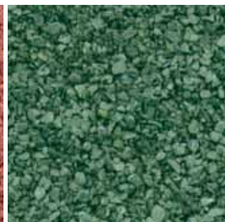
Nuraply 3PM - green

*Actual colours may vary from those illustrated. Refer to Nuraply 3PM sample sheet for more accurate colour examples.