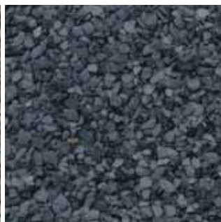
Nuraply 3PM - charcoal