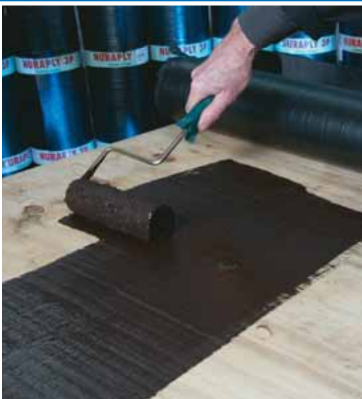
A/ Nurabond No. 10 adhesive