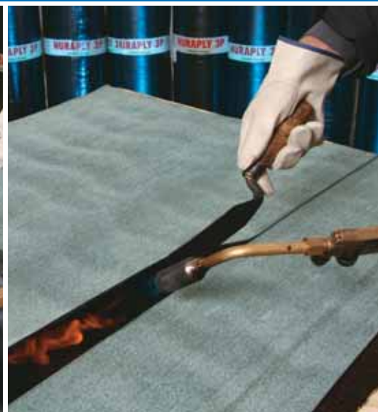
C/ Welding lap joints

Not if water is being collected for drinking. Specify instead Nuraply 3P with a Nuracolour finish.