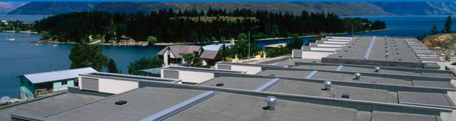
Pounamu Hotel, Queenstown