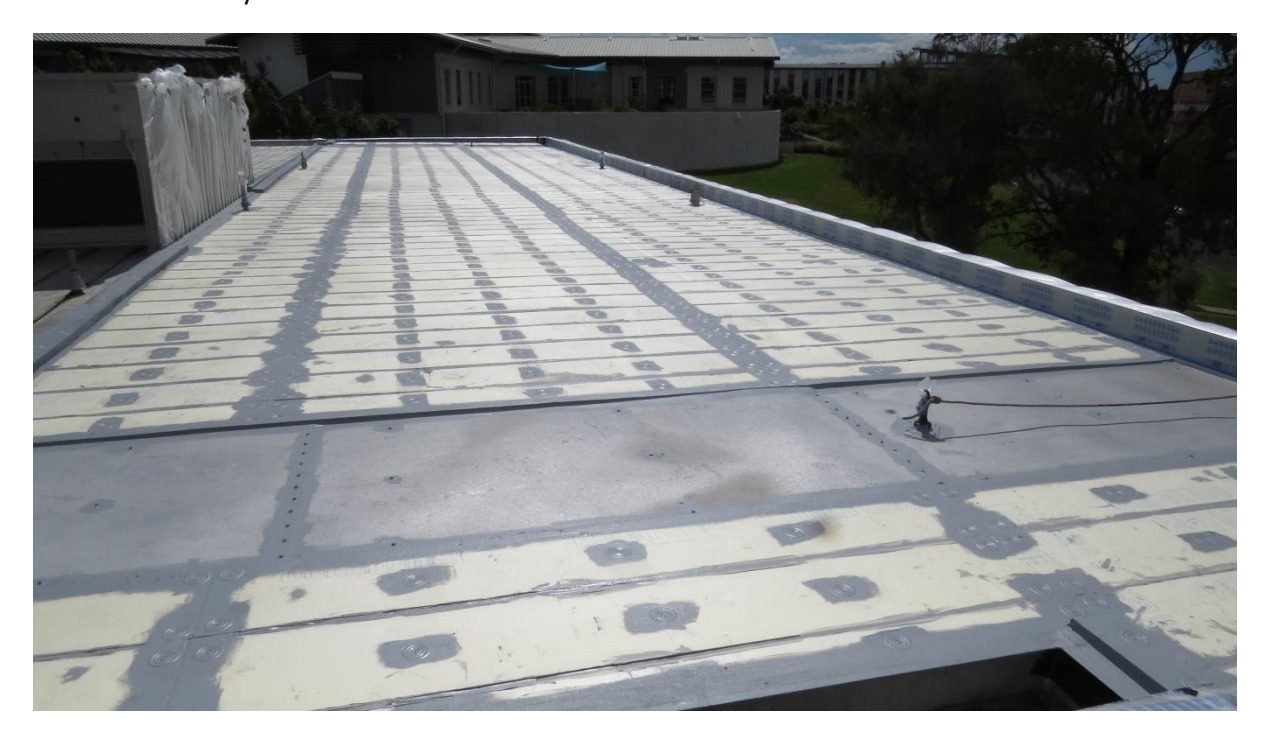
On finishing all detail works, we masked all appropriate areas to prevent any overspray. Priming was first completed then the application of Neptune Pacific, NP OneCoat was completed.

Once glued and mechanically fixed we used our NP7 Elastomagic Cement to seal all mechanical fixings making them watertight and also providing a bond breaker to the washers and HDF. Prior to the OneCoat application all cross joins of HDF were detailed with NP7 as a bond breaker to take up any movement that may occur.