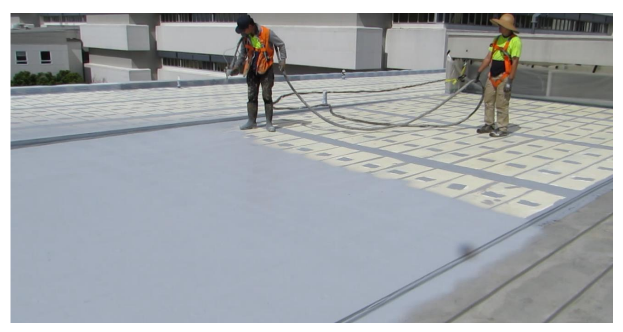
OneCoat spraying application. Not only have we achieved a watertight roof but this client will now enjoy the benefits of a warm roof and reflectivity of 80% of UV.