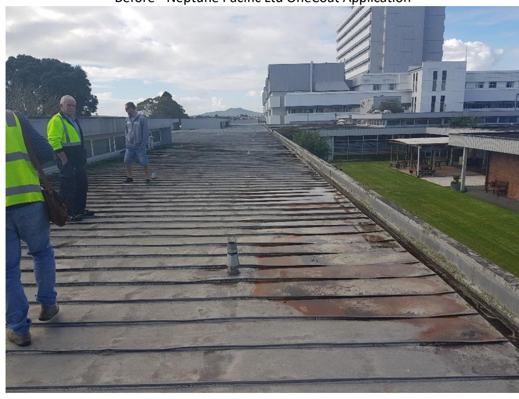
Before - Neptune Pacific Ltd OneCoat Application